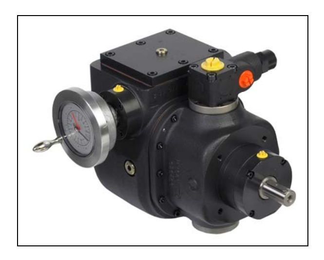
New pumps ex stock