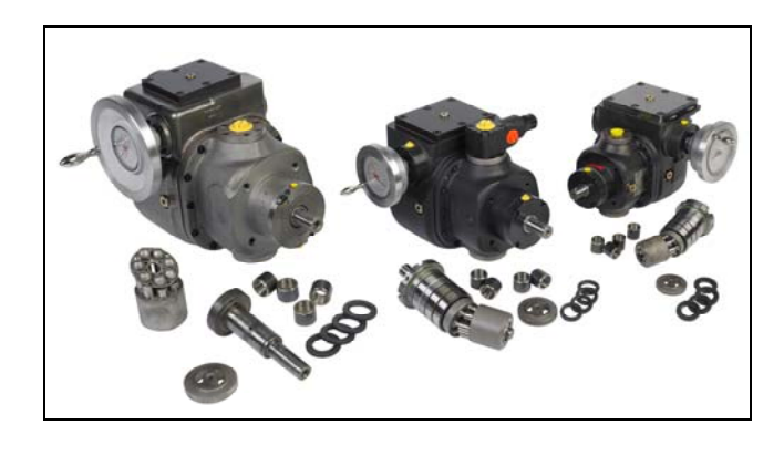
We hold a full range of spares in stock

CTM offer a comprehensive range of repair service for all major brands of pumps including RHL, Beinlich, Kracht, and Sam Hydraulik.