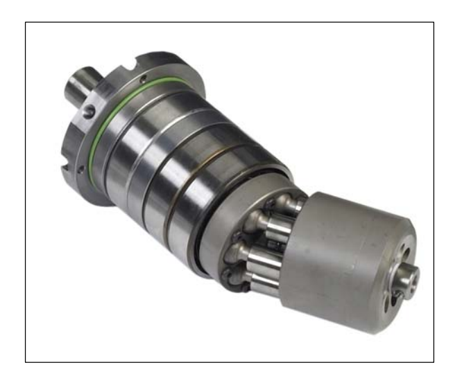
The pumping group is the heart of every pump